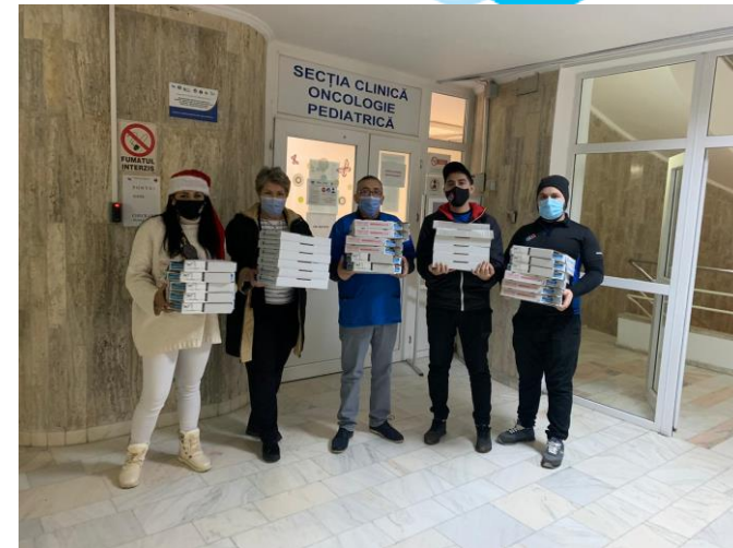
Pizza as gift for the children in hospital

These events aim to bring a smile to the faces of children being treated in Bucharest hospitals.