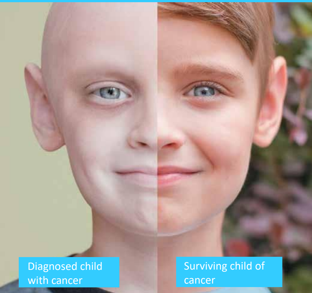
Diagnosed child with cancer