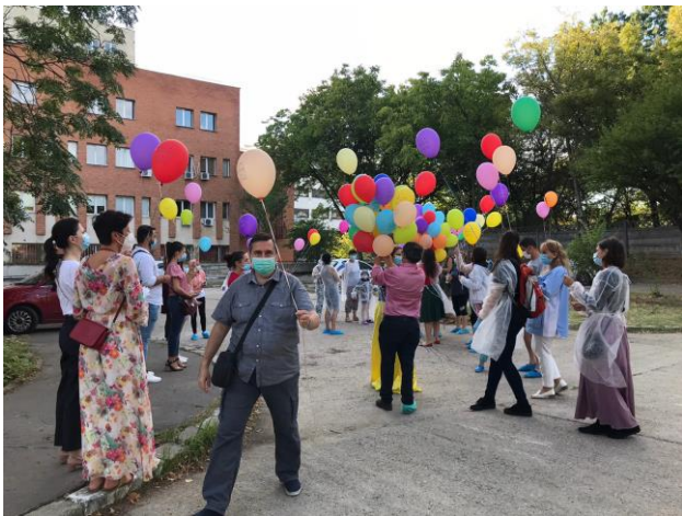
Poppies Day – A memorial Day dedicated to the children and teenagers who lost the life in the battle with cancer