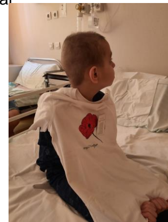
Poppies day - 2020